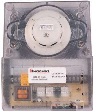
Duct housing is available with either a conventional photoelectric or ionization detector