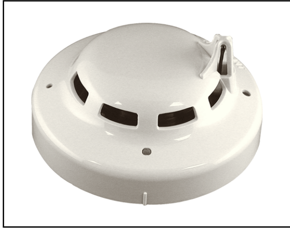
Shown without base