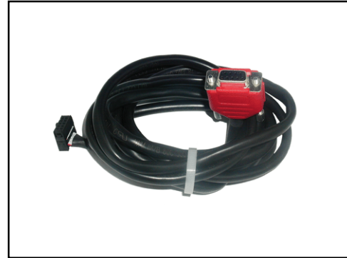
S187 Programming Cable