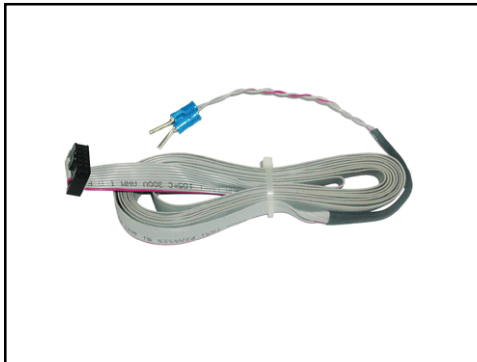
FN-V187 VoiceNET Serial Interface Cable