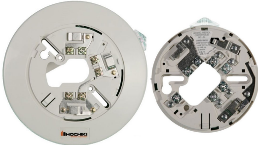
SCI-B6 & SCI-B4